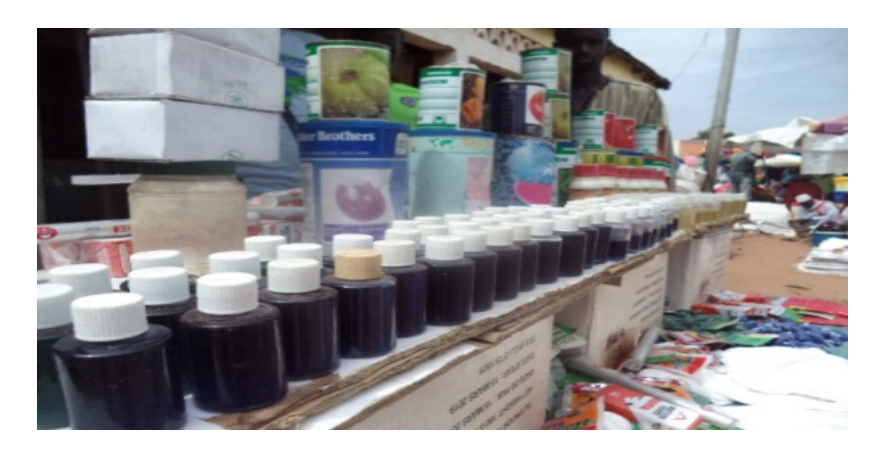
Figure 3. Some labeled and unlabeled inputs sold on the Farafenni Lumo

These products include mainly insecticides and a few fongicides: