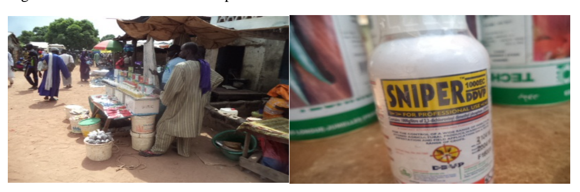
Figure 5. Insecticides and other inputs on the Wassu Lumo

Among these seasonal sellers interviewed <sup>12</sup>, some are registered. The market survey indicate that although they do not have proper shops they are licensed by the Pesticide Management Board and the sales monitored and controlled by inspectors under the national environment agency. The manner of selling was done in the open space with pesticides displayed on the table with other agricultural inputs (fertilizer, seeds, etc.). Most pesticides sold have labels so the vendors know what crops they are being used for. Some pesticides sold are unlabeled plastic bags or containers. Vendors likely mixed multiple pesticides together for resale. As for