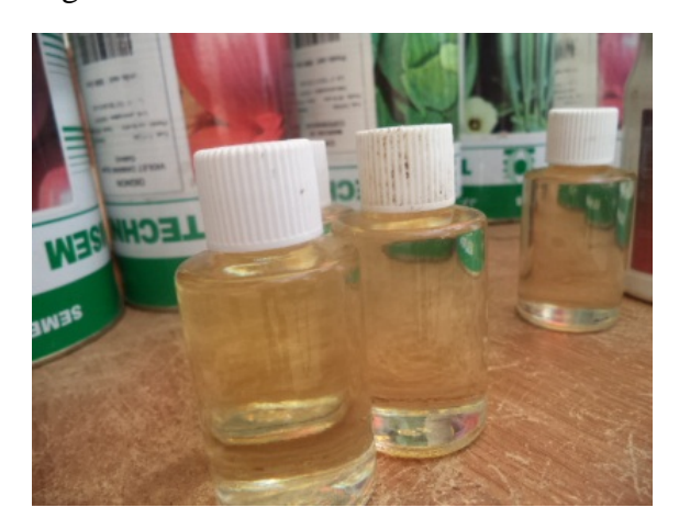
Figure 6. Insecticides sold in unlabeled containers on the Wassu Lumo

knowledge on safety precautions, the survey indicates that vendors are aware of the harmful effects of pesticides and they know the safety precautions associated to dealing with pesticides. Though, through observation they don't have any personal protective gears. Questionable, how the vendors properly mix the pesticides, how farmers apply them and protect themselves and their families during use.